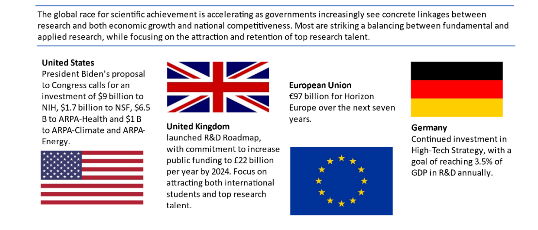
Figure 1 The Global Competition

Between 2014 and 2018, 32 countries increased spending on R&D, boosting global research spending (in PPP$ billions, constant 2005 prices) by 19.2%, outpacing the growth of the global economy (+14.8%). This translated into a rise in research intensity from 1.73% to 1.79% of GDP.